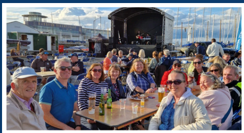
RSGYC REGATTA APRES SAIL!